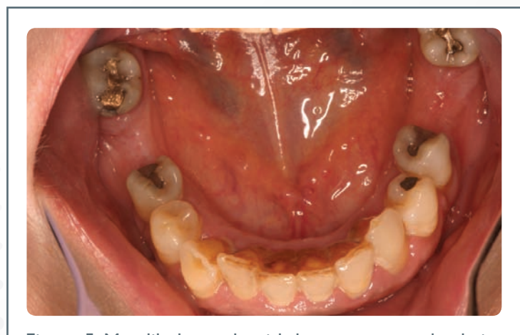
Figure 5: Mandibular arch with heavy supra and subgingival calculus.