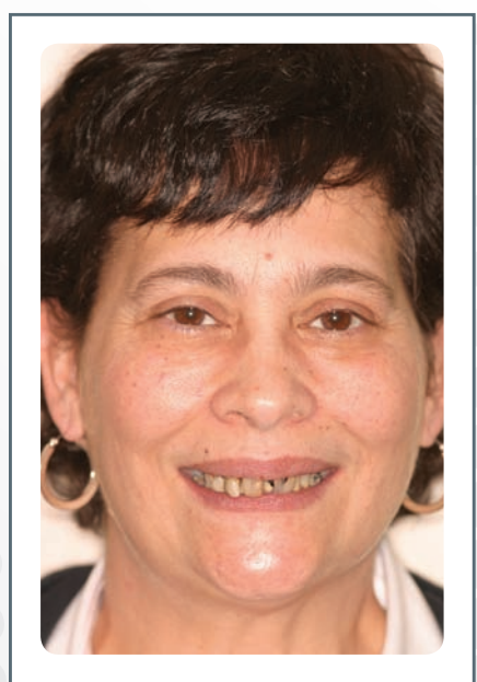
Figure 2: Full facial view smile shows carious compromised smile.