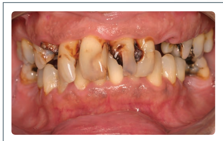
Figure 4: Retracted view displaying multiple carious and hopeless teeth.