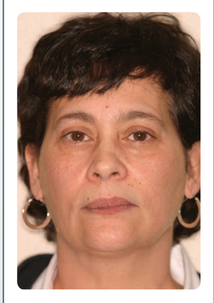
Figure 1: Preoperative full facial view reluctant to smile.

It was my pleasure to restore this broken smile and help her begin to mend her broken life.