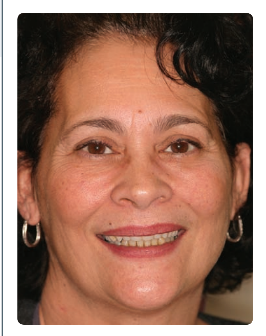
Figure 9: Postoperative view showing her new smile